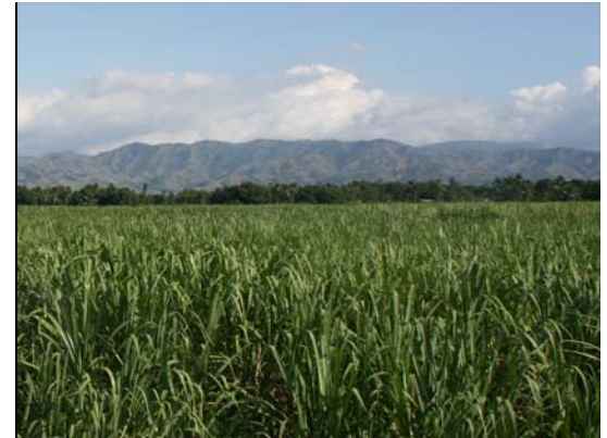
Family Health & Research Center location in Leogane

The approximate US$10M facility's two phases will be built over a five-year period. The center will be staffed by local healthcare providers, visiting administrators, and regular visiting healthcare provider teams. On-going operating costs are estimated at $60K initially, expanding to $150K annually by the time the entire facility is completed.